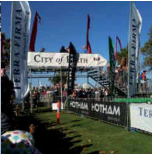
EV Ramps Ideal for Construction, Events and Public Access