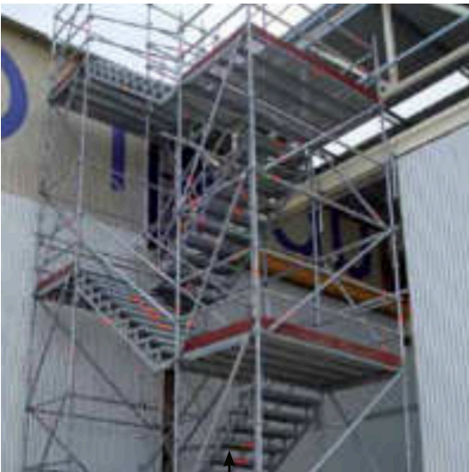
Stretcher Access Stairs

LAYHER STAIRS: Construction - Events - Public Access