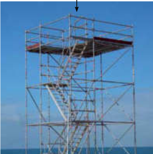
Viewing Towers. Ideal for displaying views